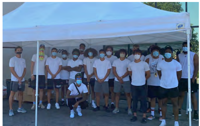
Men's Basketball continues to serve the community at the San Diego Food Bank distribution held at The Movement Church.

Email USKStudentAffairs@usk.edu with questions.